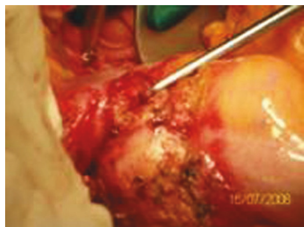
Figure 2 Duodenal neoplastic involvement